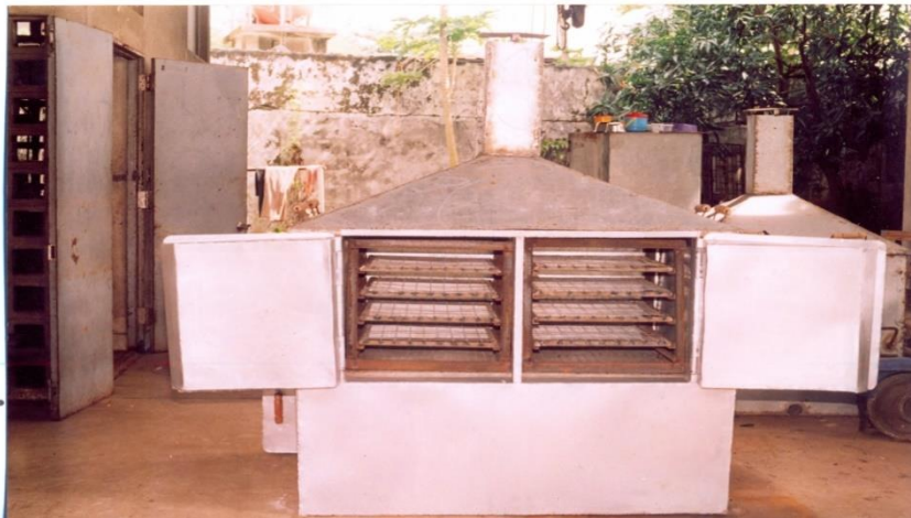
Plate 1: NIOMR Fish Smoking Kiln